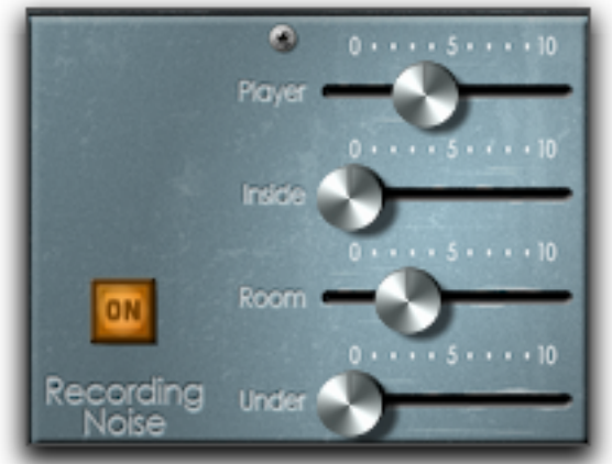
Figure 10 Vintage/Character Recording Noise

Recording Noise: Authentic signal path noise from the recording session.