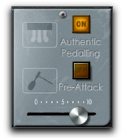
Figure 10 Authentic Pedalling and Pre-Attack On/Off

Turning Authentic Pedalling on makes Production Grand respond to the sustain (damper) pedal the same way a grand piano would beyond basic sample switching. Without Authentic Pedalling, a sustain sample or a non-sustain piano sample is played depending on the position of the sustain pedal.