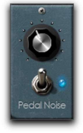
Figure 9 Pedal Noise

Every microphone perspective has its own pedal noise samples. There are nine pedal down