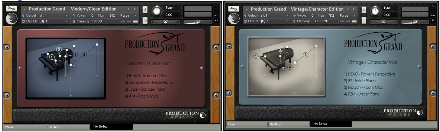
Figure 12 Modern/Clean Edition and Vintage/Character Edition Microphone Placement Graphics

Page 3's only purpose is to show where the microphones were placed for the recording session. This is useful for audio engineers and some performers. The single white round dots are the actual placement in relation to the piano. The placement is different for the Modern/Clean and Vintage/Character editions.