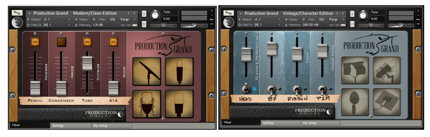
Figure 1 Production Grand Modern/Clean Edition Page 1

All the microphones have a unique character to them and are all exceptionally recorded. The choice between which microphone perspectives where put into Modern and Vintage was based on vintage appeal and microphone age. The recording quality across the microphone perspectives remains the same.