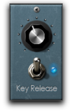
Figure 9 Key Release Controls PRODUCTION GRAND USER MANUAL

Key Release: Key Release is the volume control for samples triggered when a key is released or when the pedal is let up when a note was sustaining from the pedal, but no key is held. This is the sound of the dampers stopping the piano string from ringing.