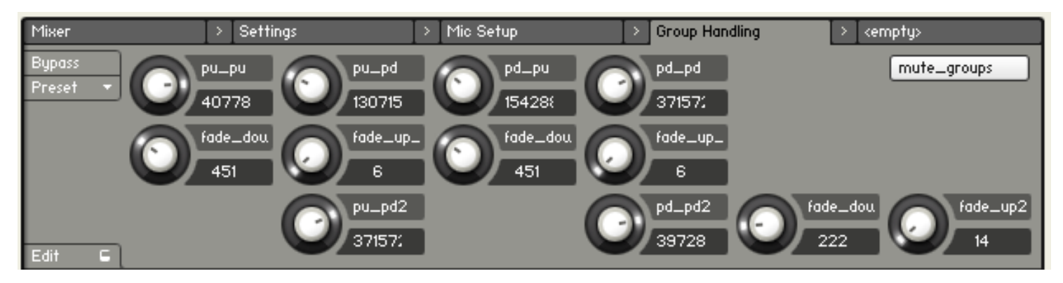
Figure 11 Hidden Authentic Pedalling Controls on Script Editor Page 4. This is for advanced users. Controls are not listed in the user manual.

Hidden Controls: All the relative speeds and volumes of the Authentic Pedalling are accessible (but hidden on the main instrument panel) by editing the fourth scripting page. This is really only for the advanced user!