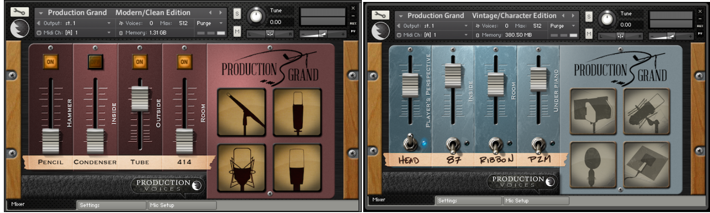
Figure 4 Page 1 Modern/Clean Mixer