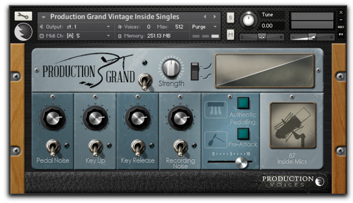
Figure 3 Vintage Singles instrument

All 8 microphone perspectives can be loaded as single instruments within Kontakt. This can save load time and