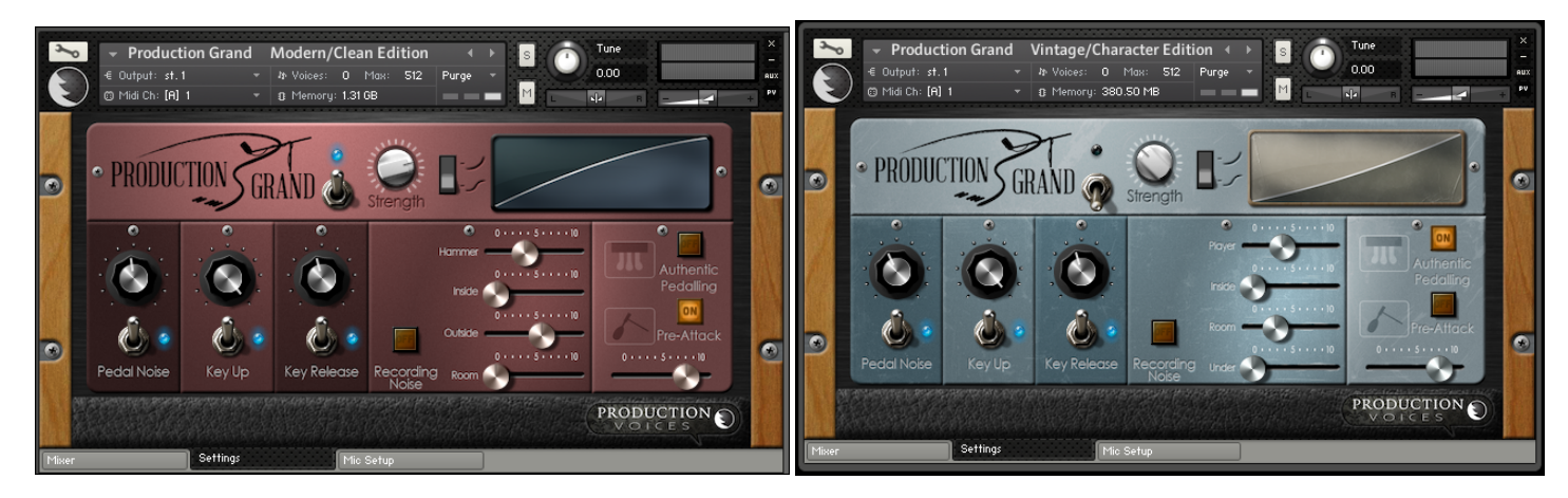
Figure 7 Production Grand Modern/Clean Edition Page 2 Settings

Page 2 settings work the same for Modern/Clean Edition, Vintage Character Edition and Singles page 1. The only difference between Singles page 1 and the multi-mic edition page 2 is that the single instrument only has one recording noise.